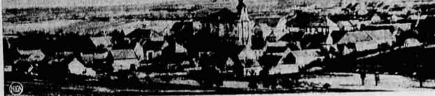
The old Lidice is now nothing but charred rubble. The charming 600-year-old village centered about the 200-year-old St. Martin's church.

Do false teeth drop, slip or wobble when you talk, eat, laugh or sneeze? Don't be annoyed and embarrassed by such handicaps. FASTERITE! an alkaline (iron-based) powder, to sprinkle on your plates, keeps false teeth more firmly set. Gives confident feeling of security and added comfort. No gummy, soapy, pasty taste or feeling. Get FASTERITE! today at any drug store.