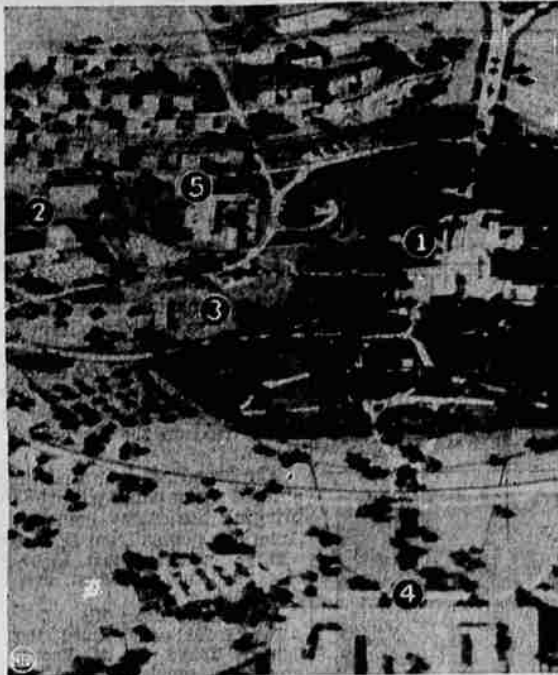
Lidice, tiny Czech town razed by the Nazis, will be rebuilt as a model community. Features will be: 1—A National Memorial park. 2—The Dr. Benes school. 3—A sports stadium. 4—A World Memorial, big enough to accommodate 60,000. 5—A 100-bed hospital.

Lidice's citizens were mostly miners and farmers. So a regional education center, including a school of mines and a school of agriculture, with a co-operative