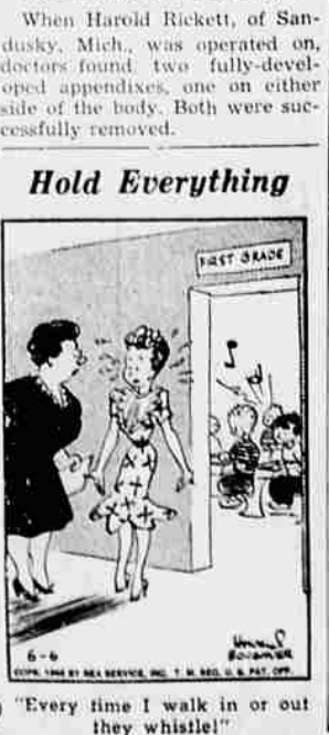
"Every time I walk in or out they whistle!"