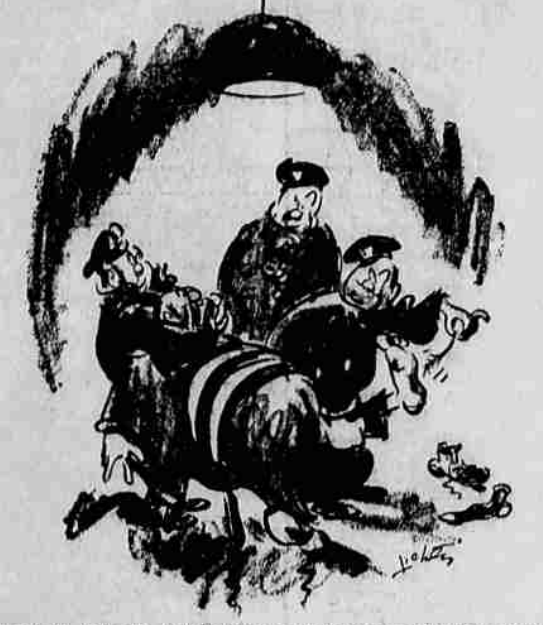
"I'll talk, I'll talk. I did it so I could get some dough to buy War Bonds."