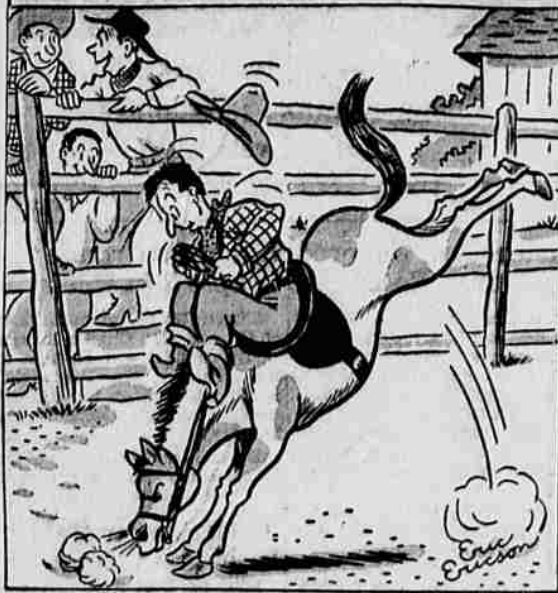
"That horse ought to put his bucks in War Bonds."