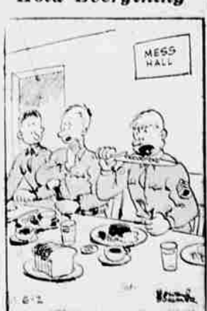
That bayonet instructor certainly knows his weapons!