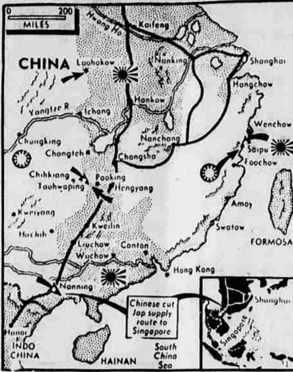
JAP LAND SUPPLY LINE CUT—Japanese land supply line to Singapore, Indo-China, Thailand and south Pacific islands is cut by Chinese capture of Nanning. Other arrows indicate Chinese drives. Jap attack after Saipu landing to halt Chinese advancing north from Fochow, and smashed Jap attack aimed at recapture of Taohwaping.

Waste Paper and Cans: Bundled waste paper and prepared tin cans may be left at the salvage depot, 1106 Jefferson street.