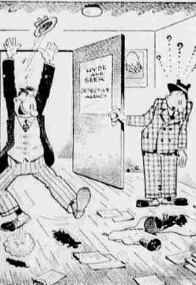
"Hooray! Our best job—somebody swiped our furniture!"