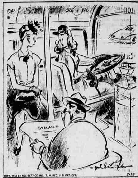
"I've been driving this bus for over a year but my husband still doesn't trust me to back our car out of the garage!"