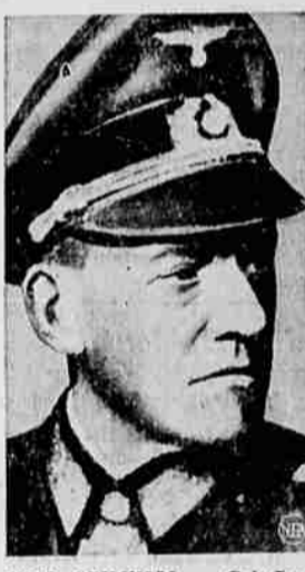
WAR CRIMINAL —Col. Gen. George Lindemann, above, who commanded German forces in Denmark. Known as the "phil-lager of Novgorod," he is high on Russia's list of major war criminals.