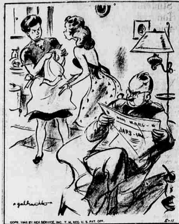
"Every time I hint about how lovely the new spring outfits are, Dad starts reading the war news out loud!"