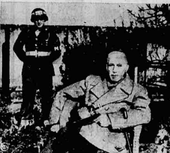
A comfortable and willing captive, Franz von Papen basks in the sunshine at his hunting lodge in Germany, under the watchful eye of an American MP.