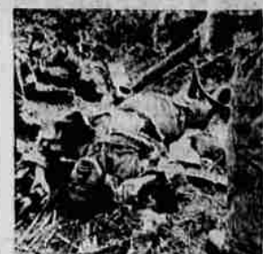
773,799 men killed

I will sell the animal to the highest bidder for cash, at a public sale to be held on the Bay