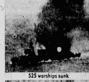
525 warships sunk