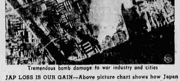
Tremendous bomb damage to war industry and cities