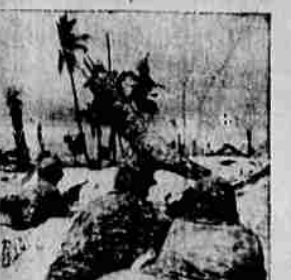
12 island groups kayoed