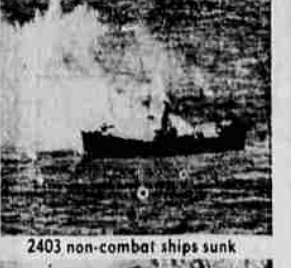
2403 non-combat ships sunk