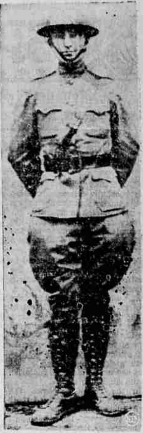
OUR NEW PRESIDENT - Harry S. Truman, upper left, in his uniform as a soldier in World War I in France, and his latest photograph, made last year. Below he is shown as a boy of 11 years and as a baby in his home town of Lamar, Mo., where he was born May 8, 1884.

American consume approximately 4,000,000,000 bottles of soft drinks annually in normal times.