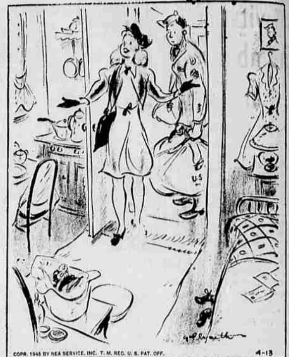
"Yes, it's small, but it's the only apartment I could find, and I thought you'd like the cozy foxhole atmosphere!"