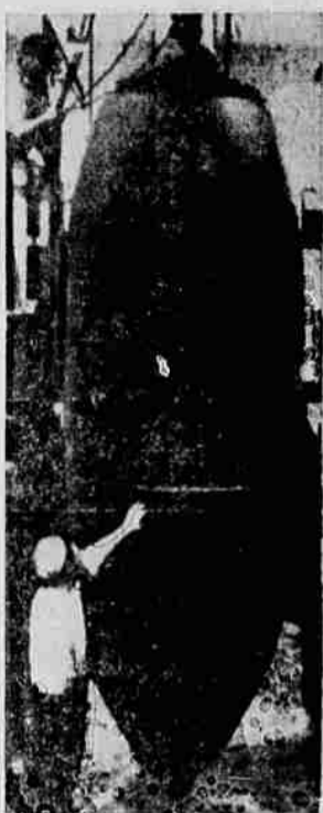
BRITISH SUPER-BOMB — This is the recently introduced 11-ton "Volcano" bomb which specially equipped RAF Lancasters have been dropping on German targets with devastating results. A British workman maneuvers the 47,000-pound monster as it progresses along huge assembly and loading line.