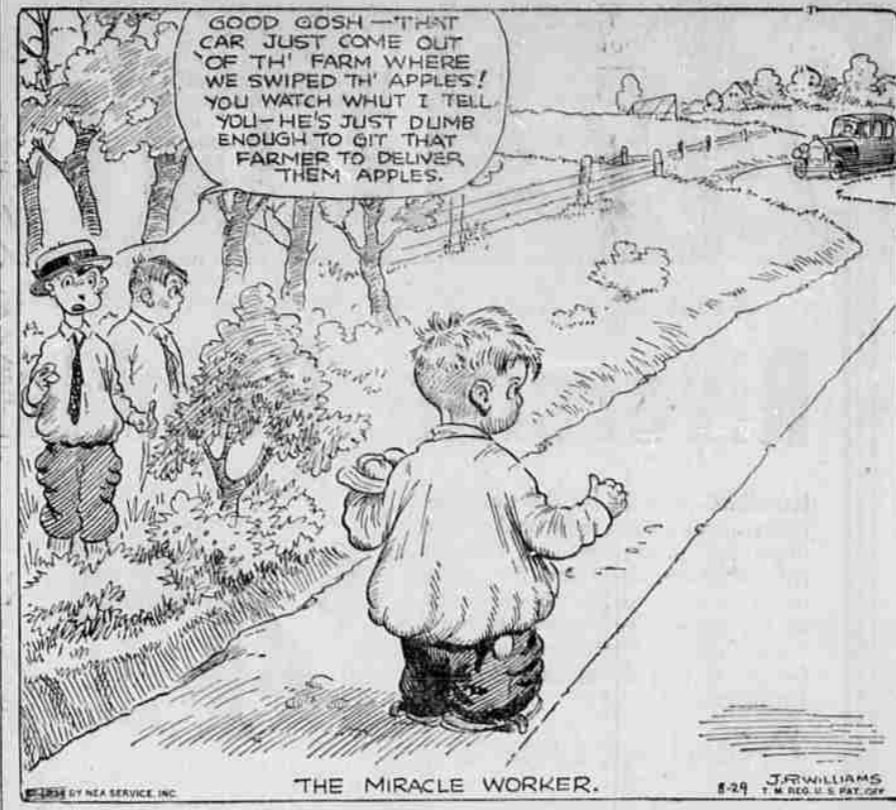
THE MIRACLE WORKER.