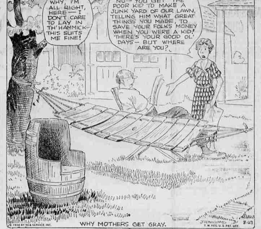
WHY MOTHERS GET GRAY.