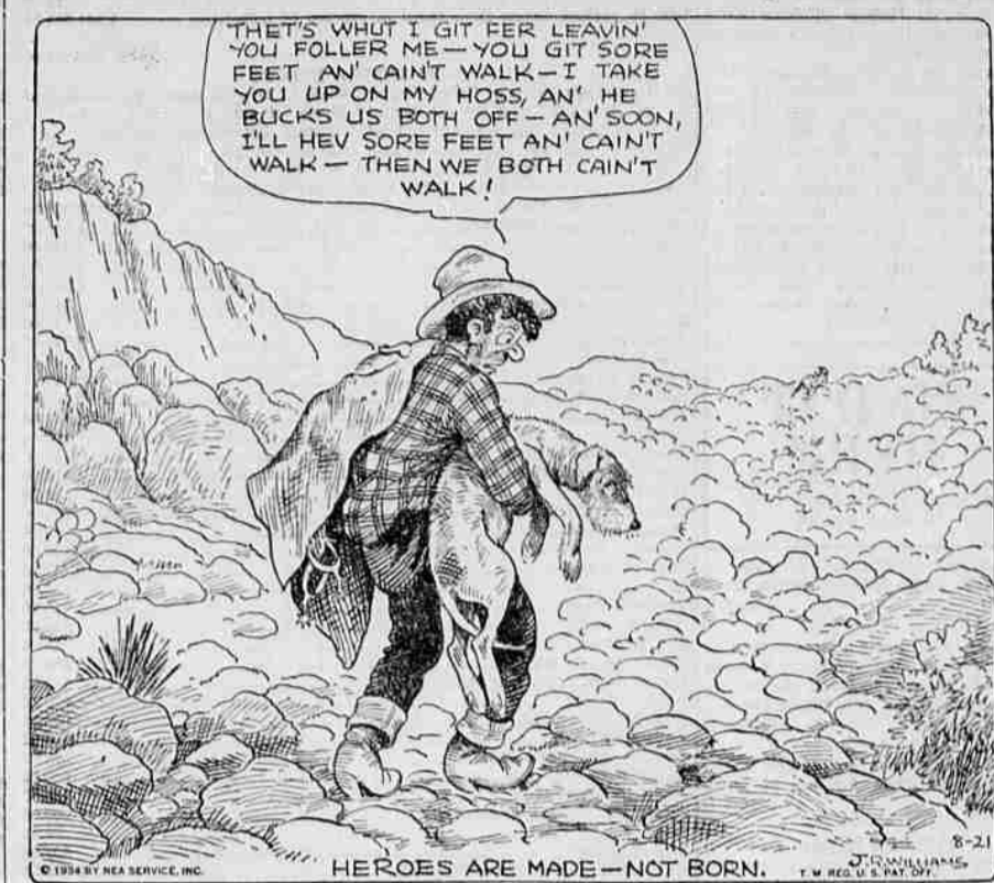
HEROES ARE MADE—NOT BORN.