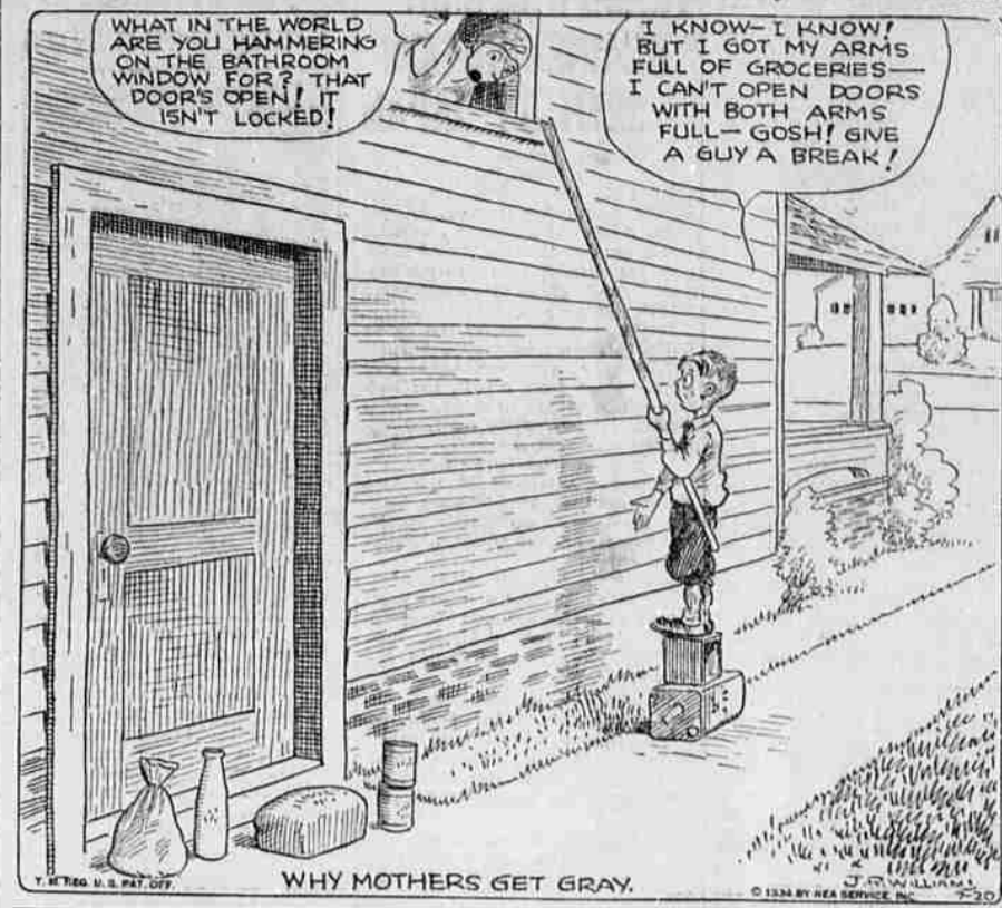
WHY MOTHERS GET GRAY.