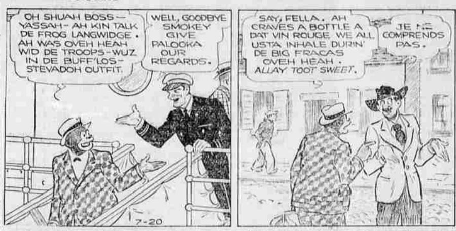
OLLY OF THE MOVIES by Ollendorff