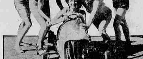
"Putt-putt!" go the gasoline motors on these tiny racers as a Century of Progress again starts off in a blaze of color and fan-fare in Chicago...