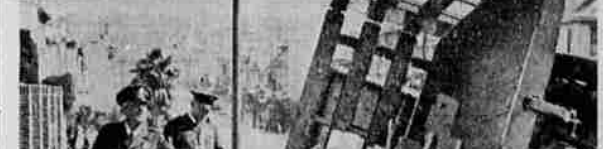
Scenes like these dotted San Francisco streets as union teamsters—3700 strong—went out on strike in sympathy with striking maritime workers. Huge trucks ceased rolling and ire of the strikers was taken out in overturning of non-union driven vehicles that attempted to make deliveries.