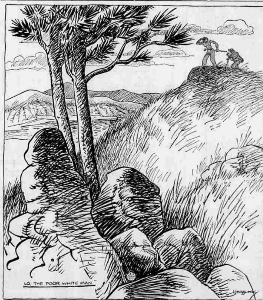
LO THE POOR WHITE MAN