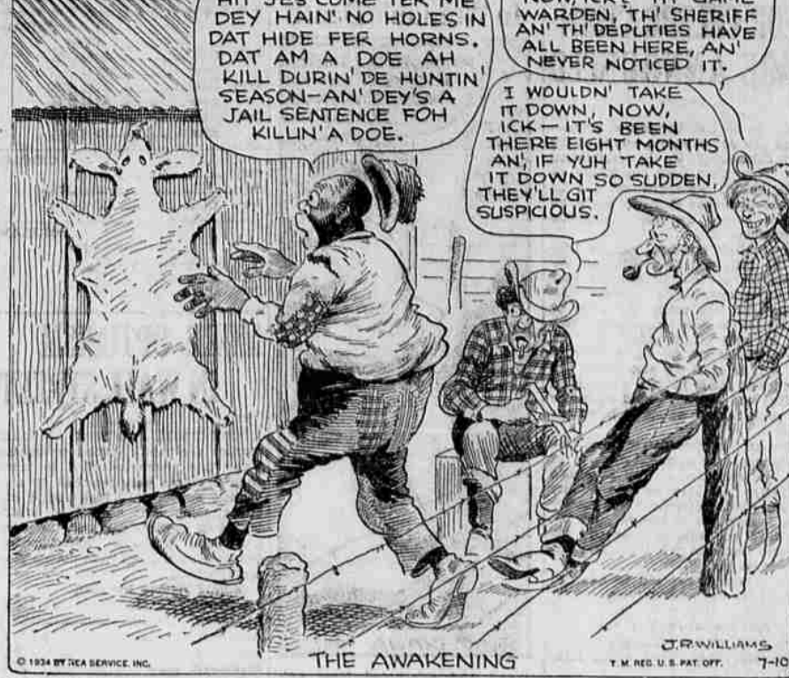
THE AWAKENING T. M. REG. U. S. PAT. OFF. 7-10