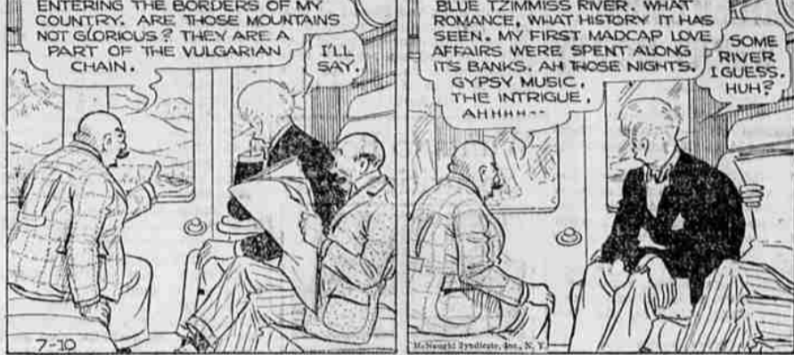
JOE PALOOKA T. M. REG. U. S. PAT. OFF. 7-10