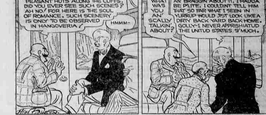
SAYS YOU T. M. REG. U. S. PAT. OFF. 7-10