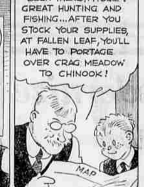
DIANA DANE T. M. REG. U. S. PAT. OFF. 7-10