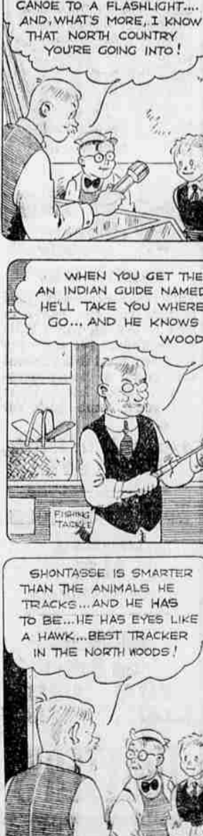
FRECKLES AND HIS FRIENDS T. M. REG. U. S. PAT. OFF. 7-10