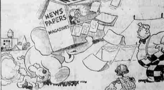
PLEASANT PRINTING T. M. REG. U. S. PAT. OFF. 7-10