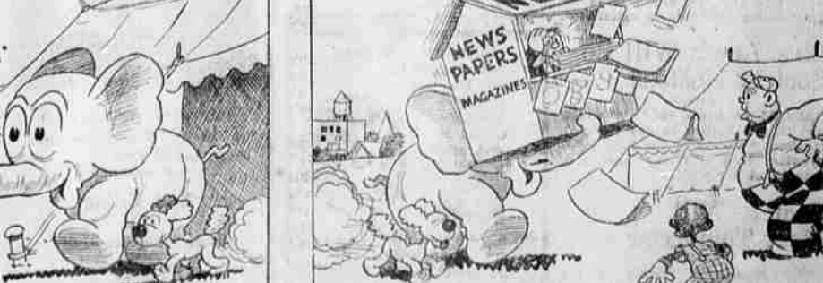
A DISCOVERY T. M. REG. U. S. PAT. OFF. 7-10