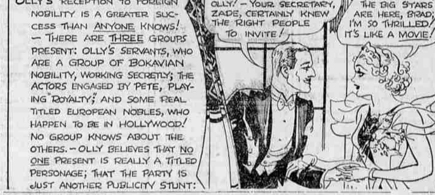
OLLY OF THE MOVIES T. M. REG. U. S. PAT. OFF. 7-10