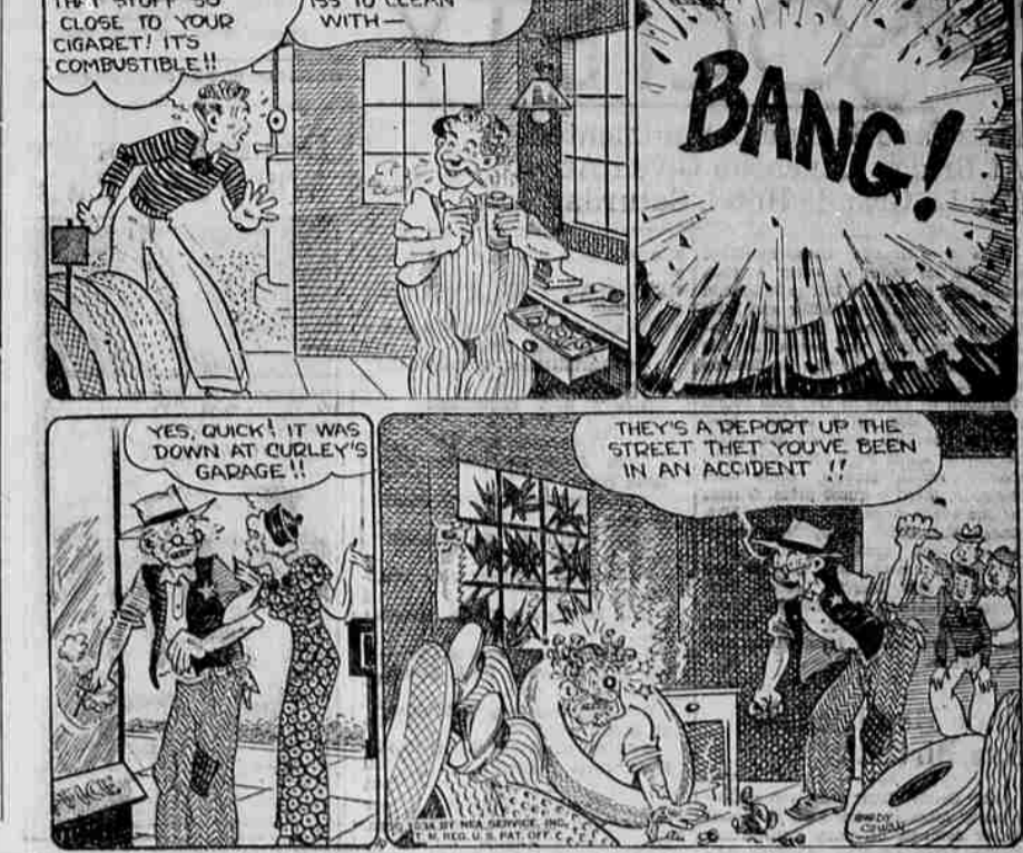
THE NEWFANGLES T. M. REG. U. S. PAT. OFF. 7-10