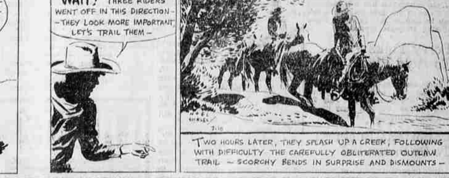
AMONG THE CAST T. M. REG. U. S. PAT. OFF. 7-10