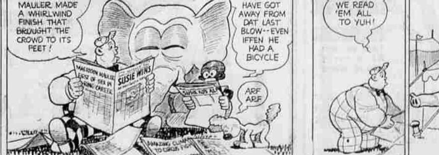
THE DILLYS T. M. REG. U. S. PAT. OFF. 7-10