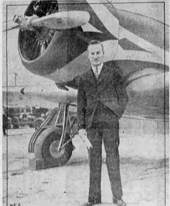
Sir Charles Kingsford-Smith—famed for his transpacific flight in the Southern Cross—receives the plane with which he will race the world's greatest aviators in the $50,000 prize London-to-Australia air classic this fall. His ship is supercharged to deliver high speed and has a cruising radius of 3500 miles.