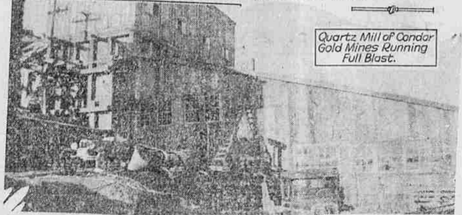
Quartz Mill of Conard Gold Mines Running Full Blast.