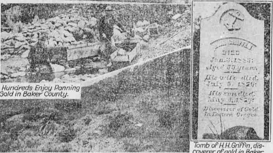
Hundreds Enjoy Panning Gold in Baker County.