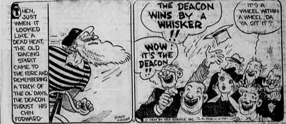
THE DEACON WINS BY A WHISKER. GETTIN' SLANGY