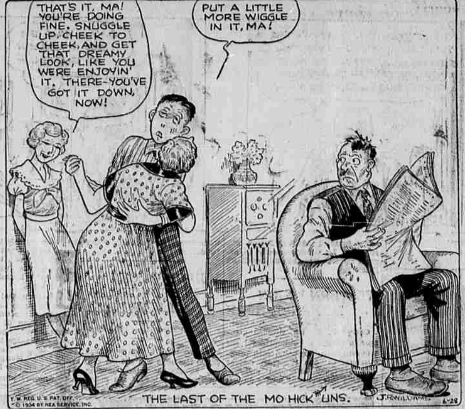
THE LAST OF THE MO HICK'UNS. JOE PALOOKA