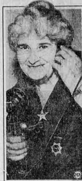
"Mrs. Maud Ballington Booth on the wire"—but the "Little Mother of Prisons" to thousands of convicts who have benefited by her philanthropic activities as head of the Volunteers of America. Mrs. Booth, 69, and smiling at the years, is pictured as she visited Los Angeles a few days ago.