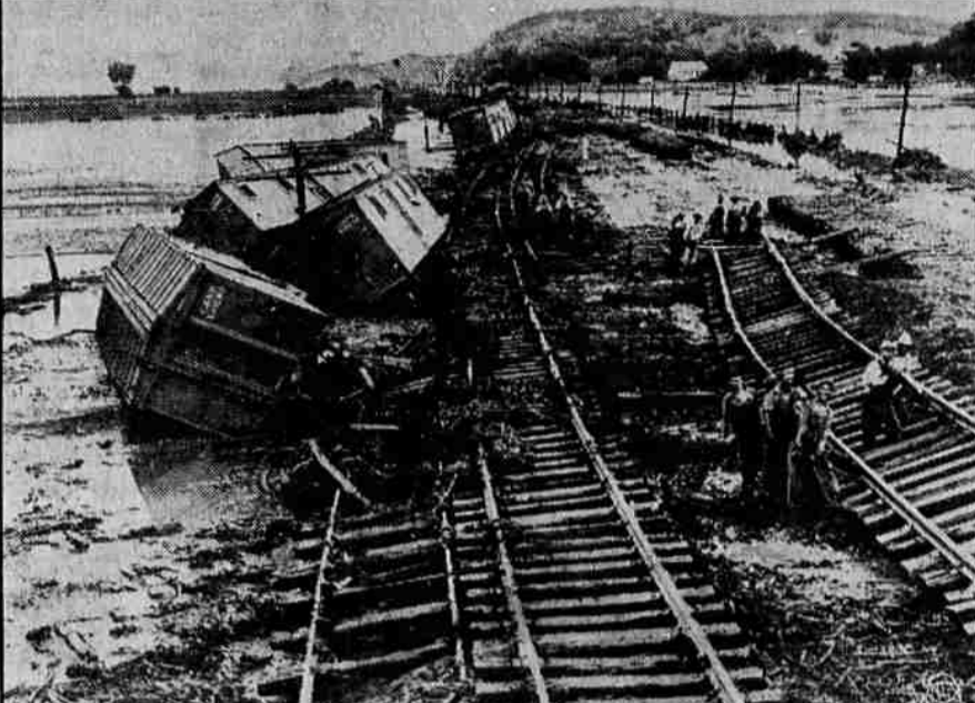
Prayers of Iowa farmers for rain were answered a hundredfold when the heavens gushed and damaging floods swept the state, parched by months of drought. Here is a remarkable picture of the toll taken by the deluge, the wreck of a train caused by washout of tracks near Council Bluffs, Ia., when Honey creek became a raging torrent overnight. With cars spilled from the rails and flood debris littering the tracks, workmen are toiling to reopen the way for trains.