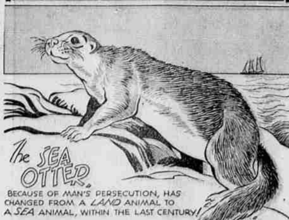
BECAUSE OF MAN'S PERSECUTION, HAS CHANGED FROM A LAND ANIMAL TO A SEA ANIMAL, WITHIN THE LAST CENTURY.