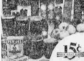
A few of her awards!