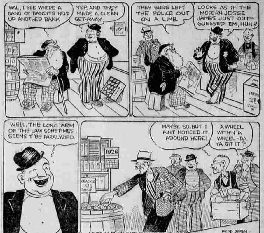
What a Reach!