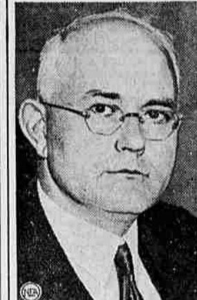
Senator James P. Pope, Idaho, above, has been named head of the Senate committee of seven to conduct an investigation of the manufacture and sale of arms and munitions.

paratively rigorous country of the northeast. The trails they followed from ocean to ocean stretch backward through distant ages around the northern shores of the Pacific to Asia.