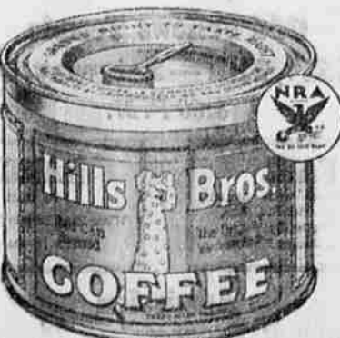
Copyright 1934 Hills Bros.

Yes, X marks the spot where you sat at your bridge luncheon yesterday and realized how dismal that "bargain counter" coffee was. Wasn't it weird how the presence of guests made you sense that uninspiring flavor? And to think that your poor husband has been drinking such coffee! You thought he was satisfied—what's more, you tried to believe you were. And all of this regret because you felt you should economize on coffee. Let's not go through this experience again. Remember, you drink coffee by the cup—not by the pound. And when you buy Hills Bros. Coffee you'll get so many fine-tasting cups of coffee that you'll want to have the girls over for lunch again—at once!