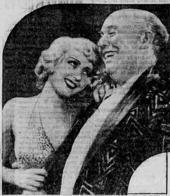
How the girls do fall for these fast traveling salesmen! Joan Blondell making hey-hey with Guy Kibbee, at the Liberty Theatre tomorrow in "Convention City".