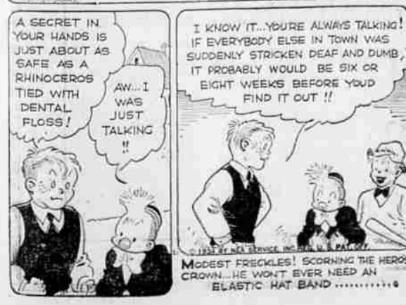
MODEST FRECKLES! SCORNING THE HERO'S CROWN... HE WON'T EVER NEED AN ELASTIC HAT BAND.....