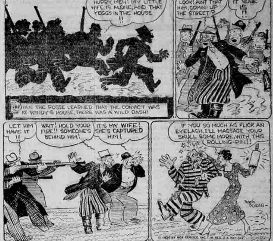
WHEN THE POSSE LEARNED THAT THE CONVICT WAS AT WINDY'S HOUSE, THERE WAS A WILD DASH!