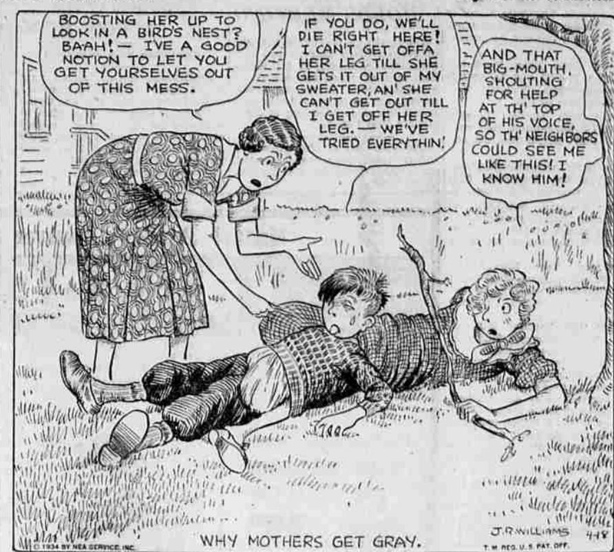
WHY MOTHERS GET GRAY.