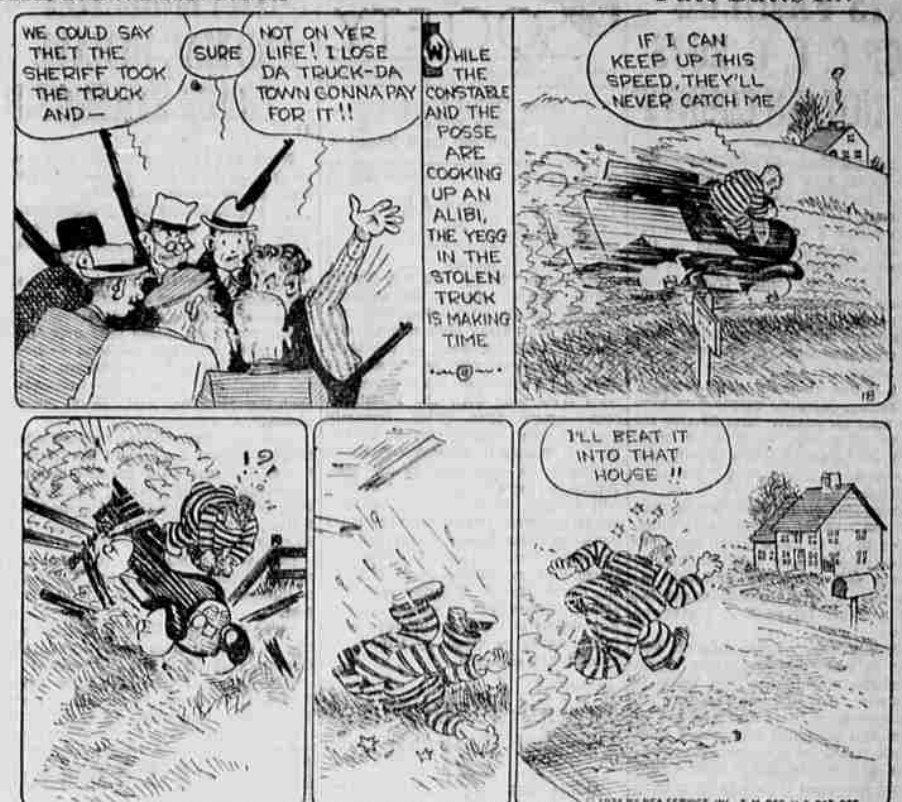
Fate Butts In!