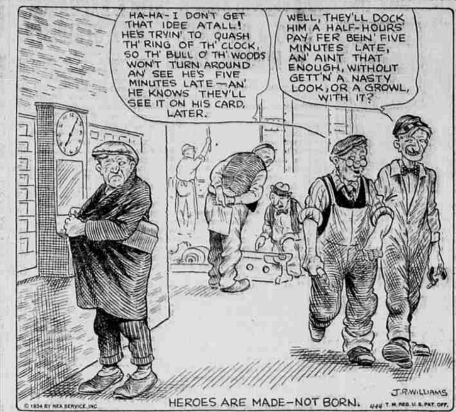
HEROES ARE MADE--NOT BORN.