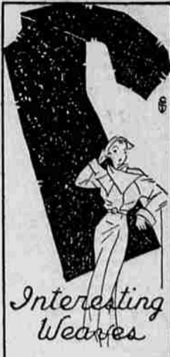
Pebbled Crepes Have Smart Roughness in the Weave

PEBBLE CREPES ARE NEW Spring smartness is woven into fabrics of all types, and silks are crepey, mossy, pebbled, ribbed, and some have coarse linen weaves. They