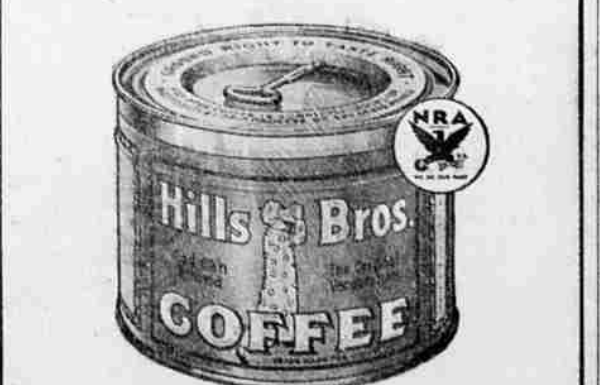
Copyright 1933 Hills Bros.