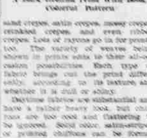
A Dark Ground Print With Bold, Colorful Pattern

Prints in silk crepe and 'prints' are not synonymous this spring. Interesting weaves are important for all fabrics, and prints may be had in