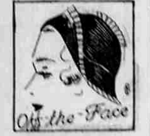
An Off-the-Face Hat with Crown Interlaced Ribbon Trim

They are becoming to most everyone, and while they are off-the-face, they do not break the expanse of the face.