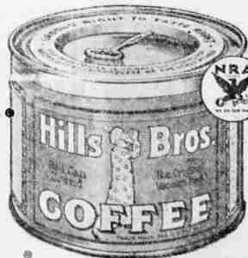
Copyright 1933 Hills Bros.

When that person you've taken for better and for purse (such as it is) comes up your steps, it's pleasant to know that you've a coffee to please him. Men are particular; they're funny that way. But you'll find that the unvarying goodness of Hills Bros. Coffee is an unmatched treat for even the most exacting tastes. And for exacting pocket books, too! It may cost a penny or so more a pound than "bargain counter" coffees, but you don't drink coffee by the pound—you drink it by the cup. If you're a family of two or twenty-two, you'll like Hills Bros. Coffee because it tastes better and goes farther. Order Hills Bros. today and look for the Arab on the can!