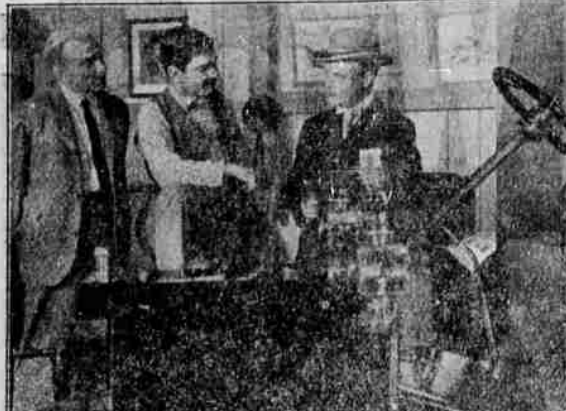
Scene from “These Thirty Years,” vivid talking film here this Friday and Saturday, courtesy Perkins Motor Co., local Ford dealers, and who invites the public to be its guest at performances.