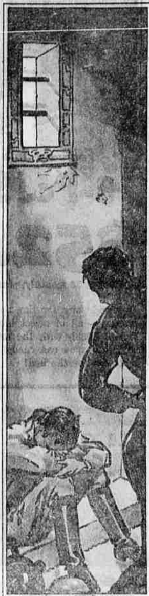
There seemed small chance of escape.