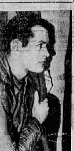
Robert Montgomery in 'Fugitive Lovers'

All the sensations of a rapid, thrilling cross-country trip are promised by advance reports to audiences at the Liberty theatre, when "Fugitive Lovers," new Metro-Goldwyn-Mayer melodrama, opens here for a two day engagement.