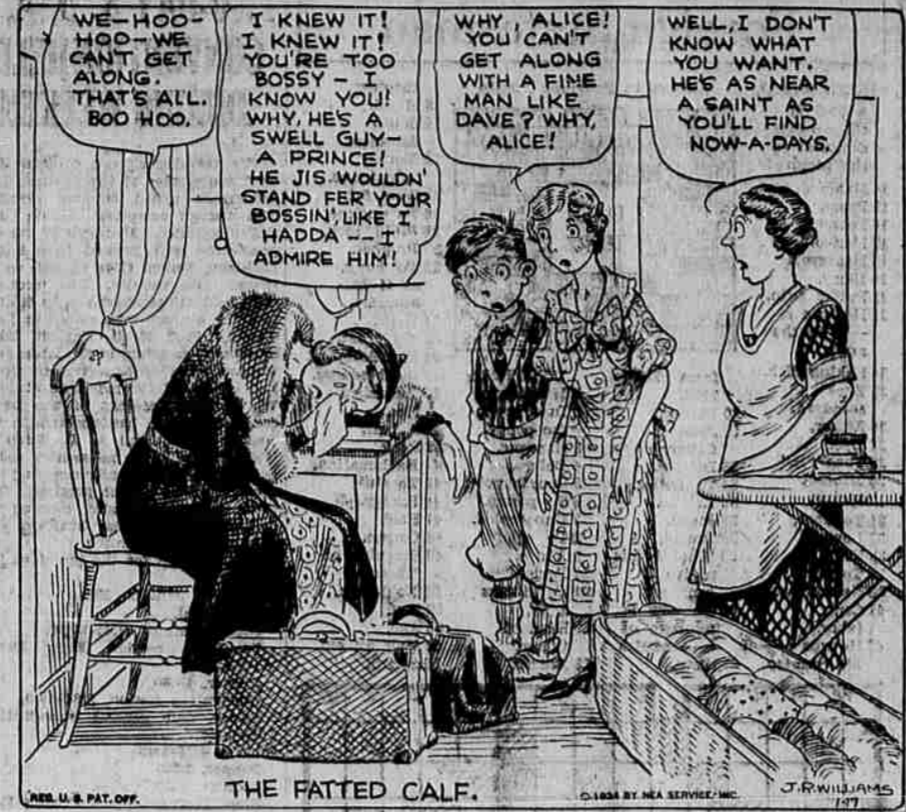
THE FATTED CALF.