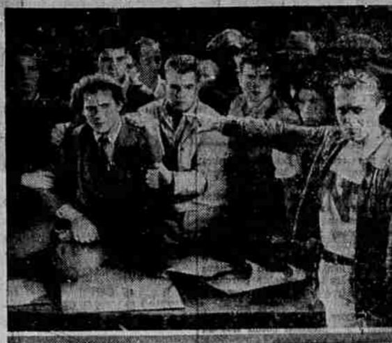
A stirring scene from "This Day and Age", which shows Thursday and Friday at the Liberty theatre.

The first great spectacle of modern times, so termed by Cecil B. DeMille, its director, himself the master of spectacles, is now to be seen on the screen of the Liberty theatre where it will run two days. It is titled "This Day and Age," the story of the struggle of the youth of an average community to oust the town's subversive influences, such as racketeers and gangsters, after all efforts of the adult community have failed. To imbue his story with the fire of youth, DeMille has brought together a cast of the more expert young players of Hollywood including Richard Cromwell, Eddie Nugent, Ben Alexander and Judith Allen, one of his own discoveries. Filling the roles of the adult members of the cast are Charles Bickford, Harry Green, Fuzzy Knight, Bradley Page and George Barbier.