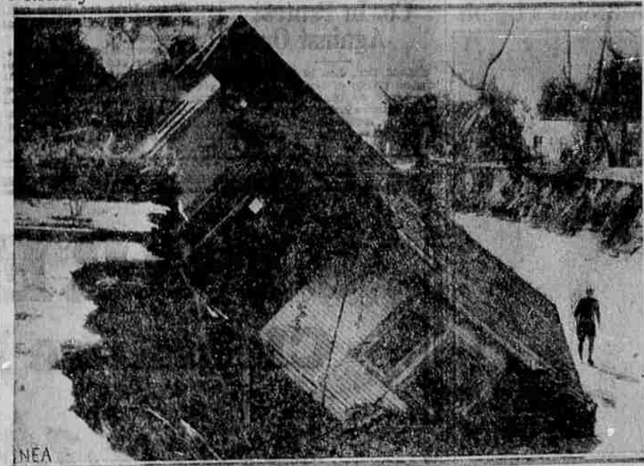
The occupants of this house all left it just before it collapsed after flood waters cut away the bank on which it stood in Verdugo Woodlands, near Los Angeles. Scores of slightly homes along ravines were destroyed New Year's morning when torrential rains filled the dry creek beds with flood waters.