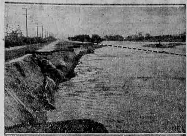
Wreckage of Riverside drive, one of Los Angeles' wide scenic boulevards, is shown in this picture, taken near Griffith Park. Huge sections were undermined and torn out by the flood waters of Los Angeles River. Dotted line indicates former width of boulevard.