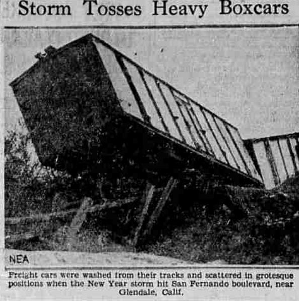
Freight cars were washed from their tracks and scattered in grotesque positions when the New Year storm hit San Fernando boulevard, near Glendale, Calif.