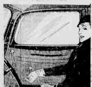
To open ventilators, give handle half-turn after window is raised to the top. Simple. Easy. Efficient.