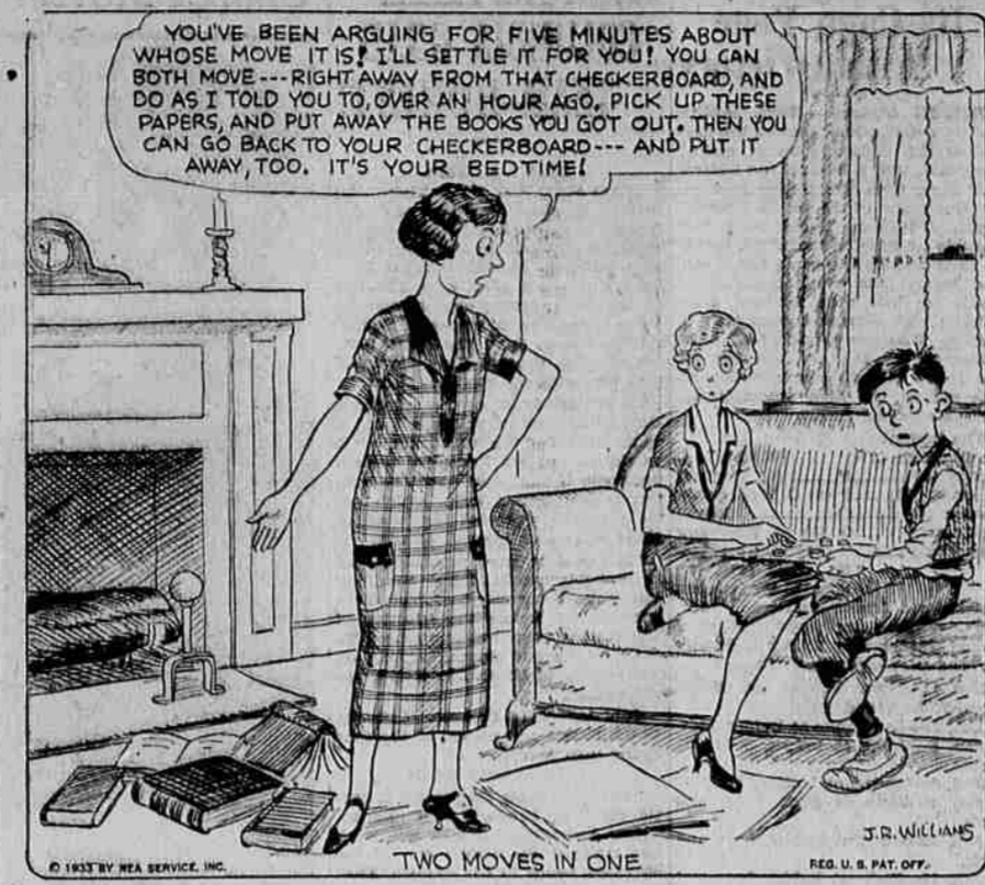
TWO MOVES IN ONE