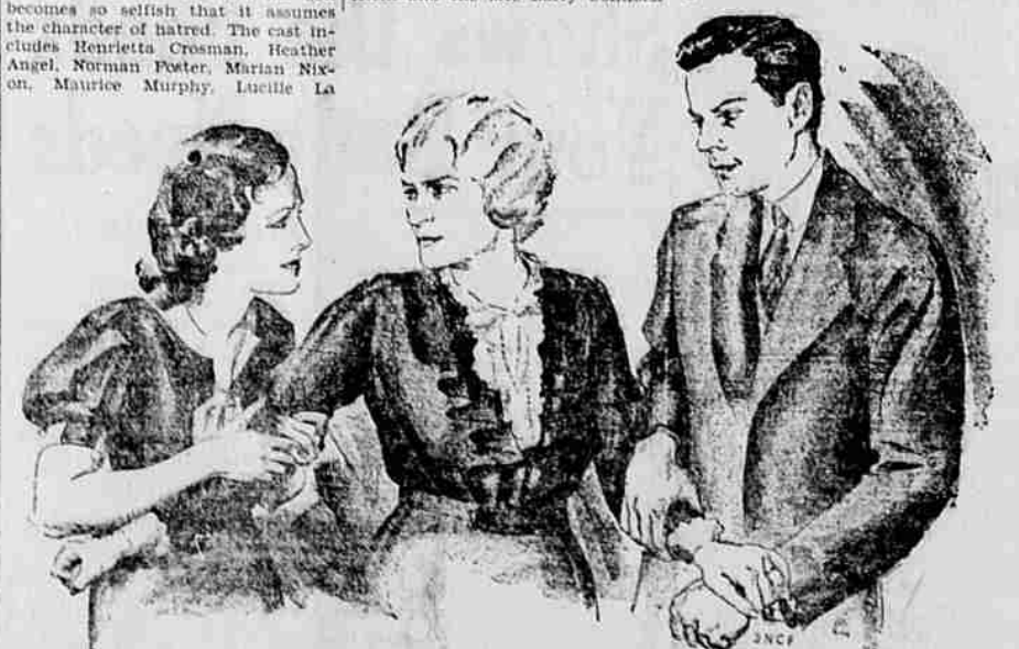
This drawing is of three of the principals in the Fox production, "Pilgrimage." From left to right, they are Marian Nixon, Henrietta Crossman and Norman Foster.

Then Go To Lukson's Beer Garden Old Oregon Trail - One Mile East