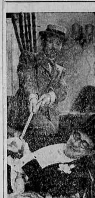
El Brendel thinking that Walter Catlett is fit to be tied—one of the scenes in the new Fox comedy, "Olsen's Big Moment."

In "Olsen's Big Moment," the new Fox film that opens tomorrow at the Liberty theatre, El Brendel is elevated from the position of a supporting comic to that of principal performer. If this picture is an example of what the Scandinavian comedian can do on his own, then we want more pictures with him in the featured part. "Olsen's Big Moment" is a definite contribution to the new deal in amusing entertainment.