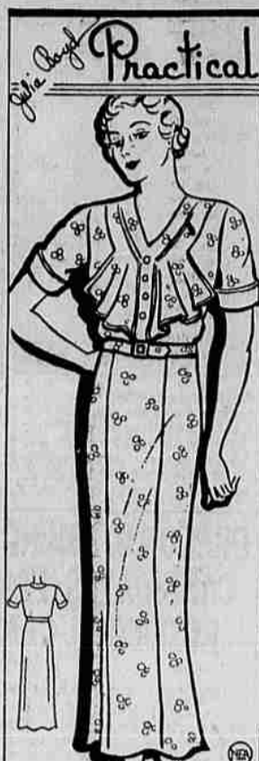
Comfortable and smart in this house frock made of bright cotton print.

The Women's auxiliary to the Old Timers' club of the railroad entertained last night at their first social activity since organization and the event proved to be very successful. Tables were arranged for pinocle, bridge and jig-saw puzzles and the Old Timers were invited following the business session.