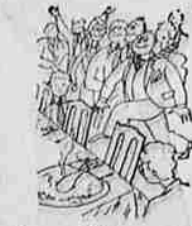
Large Table... easily serves 10 people

Beautifully designed 8 piece suite! Wards' price something to be thankful for!