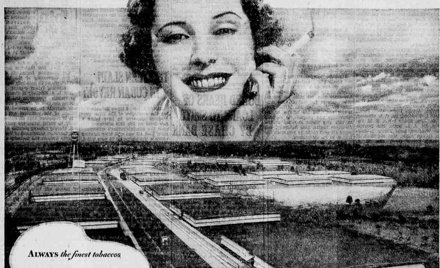
Airplane view of American Tobacco Company warehouses at Reidville, N. C.